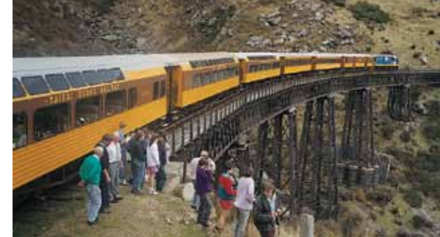
Track & Trail bus departing from Queenstown/Wanaka Sightseeing day trip between Queenstown, Wanaka and Dunedin via Otago Rail Trail and Taieri Gorge Train