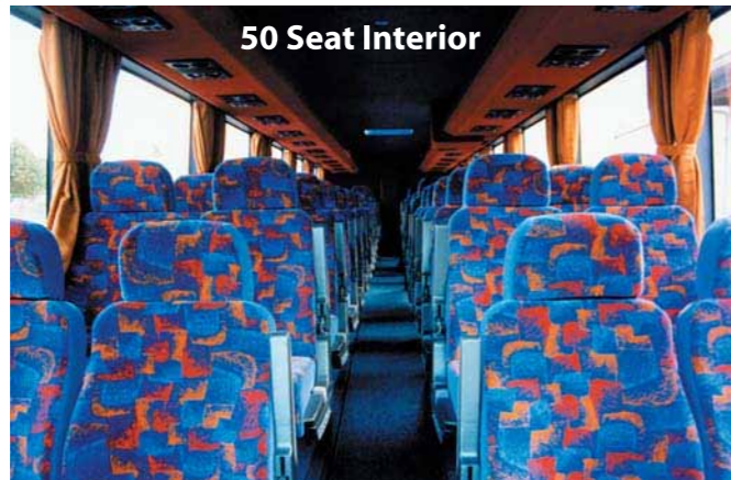
50 Seat Interior